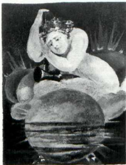
Blake, The Song of Los , plate 8, copy E. Color printed in 1795 from a copperplate, probably unincised, 23.5 x 17.5 cm. Huntington Library. To be included in the Huntington's exhibition, "Blake's Illuminated Prints," fall and winter 1994.