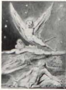
THE WORLD OF INNOCENCE