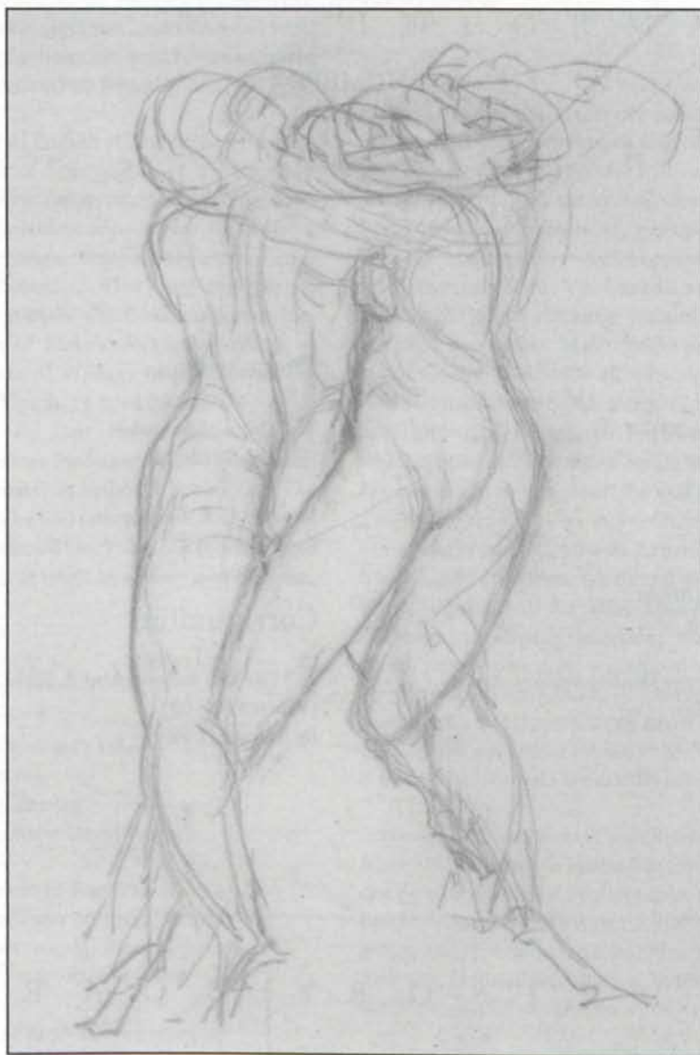
Blake in the Marketplace, 2007