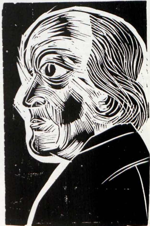
Blake portrait for Proverbs of Hell , Taurus Press