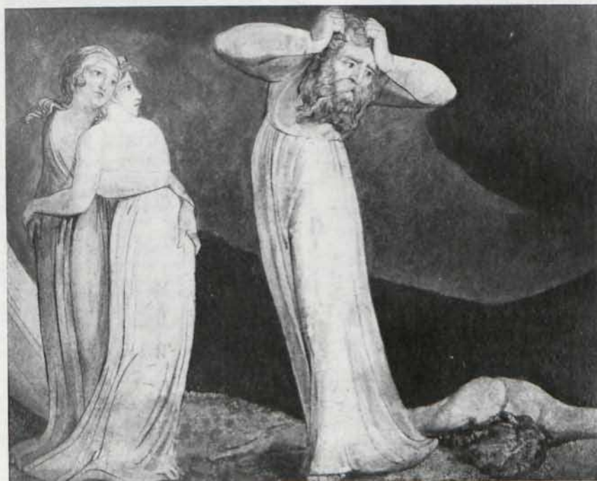
1 "Lamech and His Two Wives." Color printed drawing, 1795. Author's Collection.

It is difficult to make any completely false generalization about the Blake market in 1974 and 1975. Prices were up; prices were down. It was a good market for buyers (of certain types of materials); it was a good market for sellers (of other types of materials). New record prices were set, while important works failed to find buyers even at moderate prices. It was the worst of times; it was the best of times. A combination of economic difficulties, particularly in Britain, and a strong book and print market over the last ten years drove a number of medium-priced items out of hiding. In his 1921 Bibliography of William Blake , Geoffrey Keynes noted that the third edition of Erasmus Darwin's Botanic Garden (1795) was "considerably scarcer than the other two." In the last two years, no fewer than ten copies of this edition appeared on the market, three more than the first edition and eight more than the second. In the 1920s, the Botanic Garden was not traded primarily as a Blake item. But now it is, and thus the third edition, containing an additional plate by Blake after Fuseli, is more valuable than the earlier editions. The third was never any rarer, in absolute terms, than the others, but the market made it seem that way until dealers began to ferret out what is now the