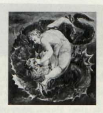
WILLIAM BLAKE IN THE ART OF HIS TIME