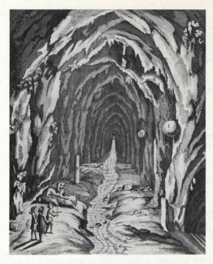
Illus. 1, "The Devil's Arse," from Charles Leigh's The Natural History of Lancashire, Cheshire, And The Peak, in Derbyshire, Oxford, 1700.

The absorption of the Peak, East Moor and the caverns and mines of Derbyshire (see Blake Concordance) into Blake's myth in Jerusalem may stem from his imaginative reading or recollection of another of Leigh's plates which illustrated the interior of Pooles Hole in the same county. This plate shows a guide and a pair of tourists undergoing