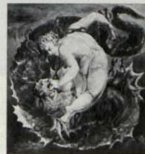
WILLIAM BLAKE IN THE ART OF HIS TIME