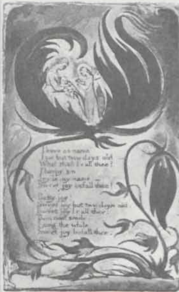
Frontispiece and Titlepage, William Blake: The Painter as Poet , catalogue of the Adelphi exhibition.