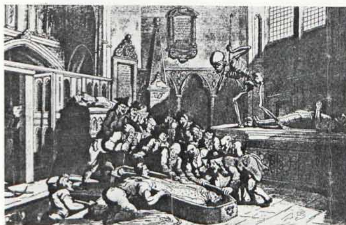
"Death and the Antiquaries", from Thomas Rowlandson's English Dance of Death , c. 1795