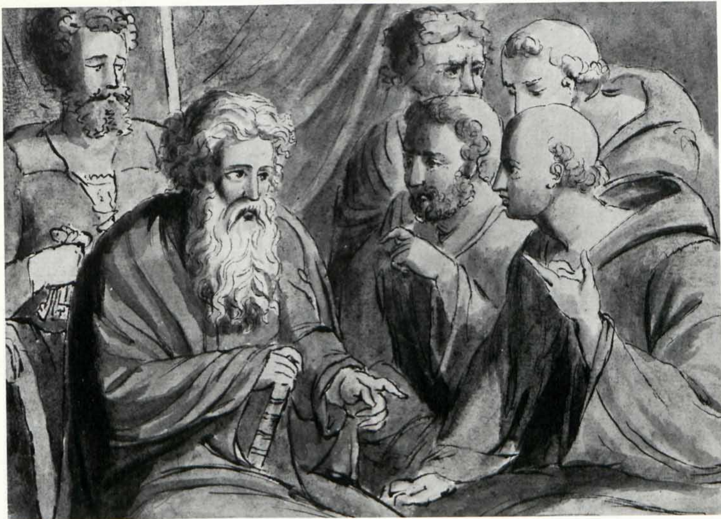
4 Blake. "Saint Augustine Converting King Ethelbert of Kent." Watercolor, c. 1799-80, 12.7 x 17.8 cm.

July 1976 cat., #22 (£125). Rebacked, rubbed, lacking half-title. SH, 12 Nov. 1976, #383 (£85). Original boards, uncut. Quaritch, Dec. 1976 cat. 967, #27 ($525). Tall copy. Quaritch, June 1977 cat. 971, #28 ($315).