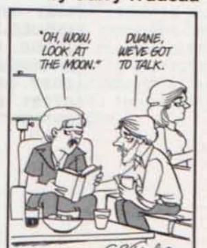
Copyright 1979 G.B. Trudeau. Distributed by Universal Press Syndicate Reprinted with permission.