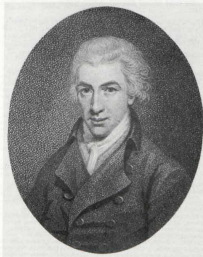
Hull: William Hayley, 1800