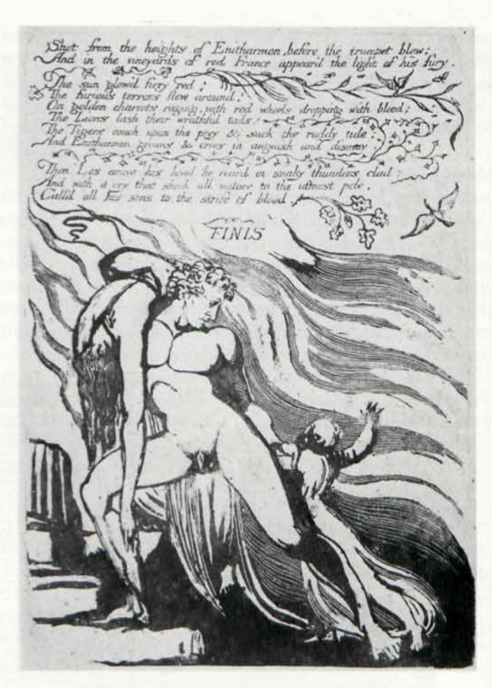
1. Blake. Europe, pl. 18, third state. Relief etching, 23.4 x 16.6 cm. Museum of Art, Rhode Island School of Design, Providence.

The copy in my collection is bound in full calf. Nothing about this binding suggests a date later than the 1790s, although one can not rule out the possibility that the