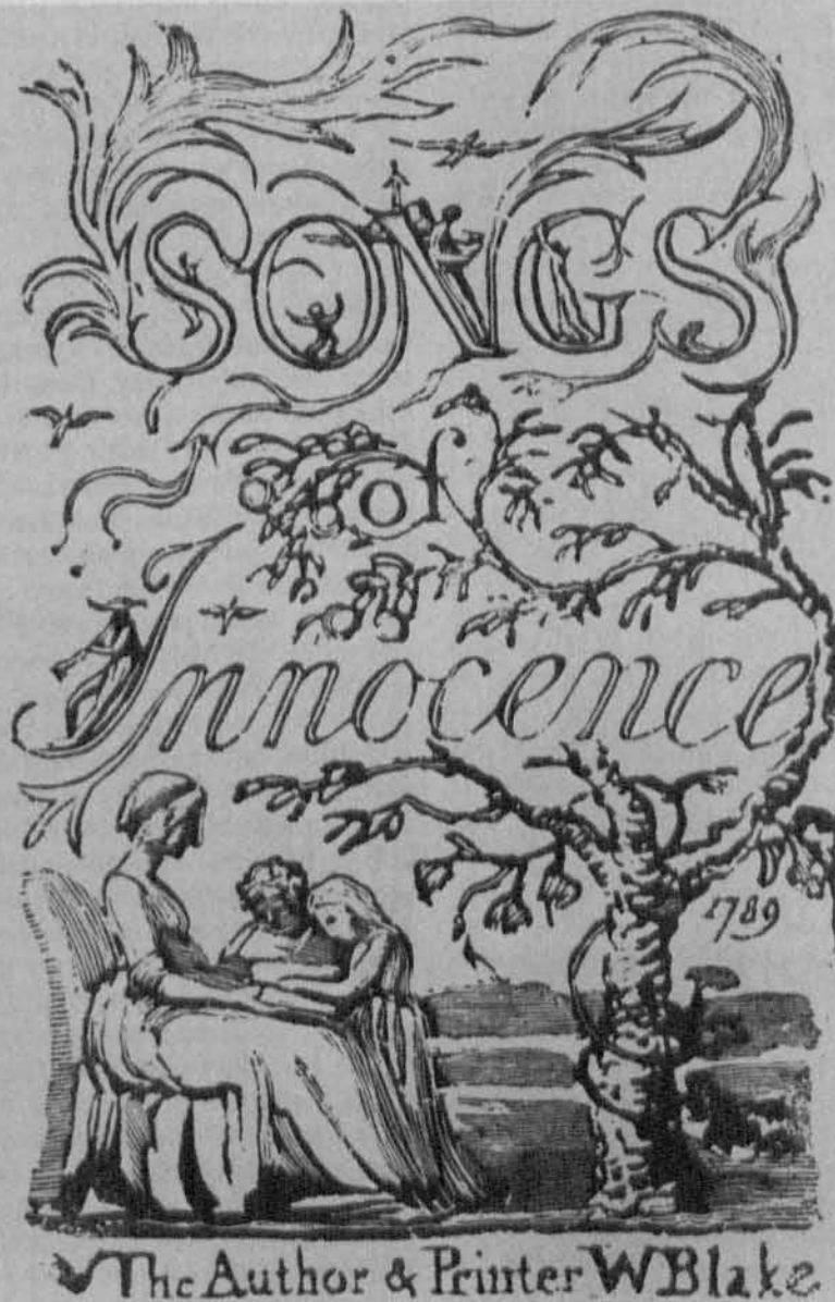
4. Blake. Songs of Innocence , title page. Impression in green ink from the Fitzwilliam electrotpe and published in W. Blake, Songs of Innocence and of Experience: Sixteen designs printed from electrotypes of the original plates for Ruthven Todd and Geoffrey Keynes (Chiswick Press, 1941). Image 11.8 × 7.3 cm.

There are of course differences between copy B and the facsimile. The colors are not identical in every case, the pen and ink lines swell or narrow in slightly different ways, and margins of some washes do not correspond exactly to the original. 22 Cataloguing these minor variants would serve little purpose, for we cannot expect any hand-made facsimile to match an illuminated book brush-stroke by brush-stroke, reticulation by reticulation.