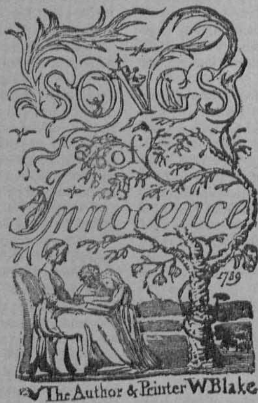
1. Blake. Songs of Innocence , title page. Manchester facsimile, based on the Victoria and Albert electrotype, printed in brown ink. Image 11.8 × 7.3 cm.