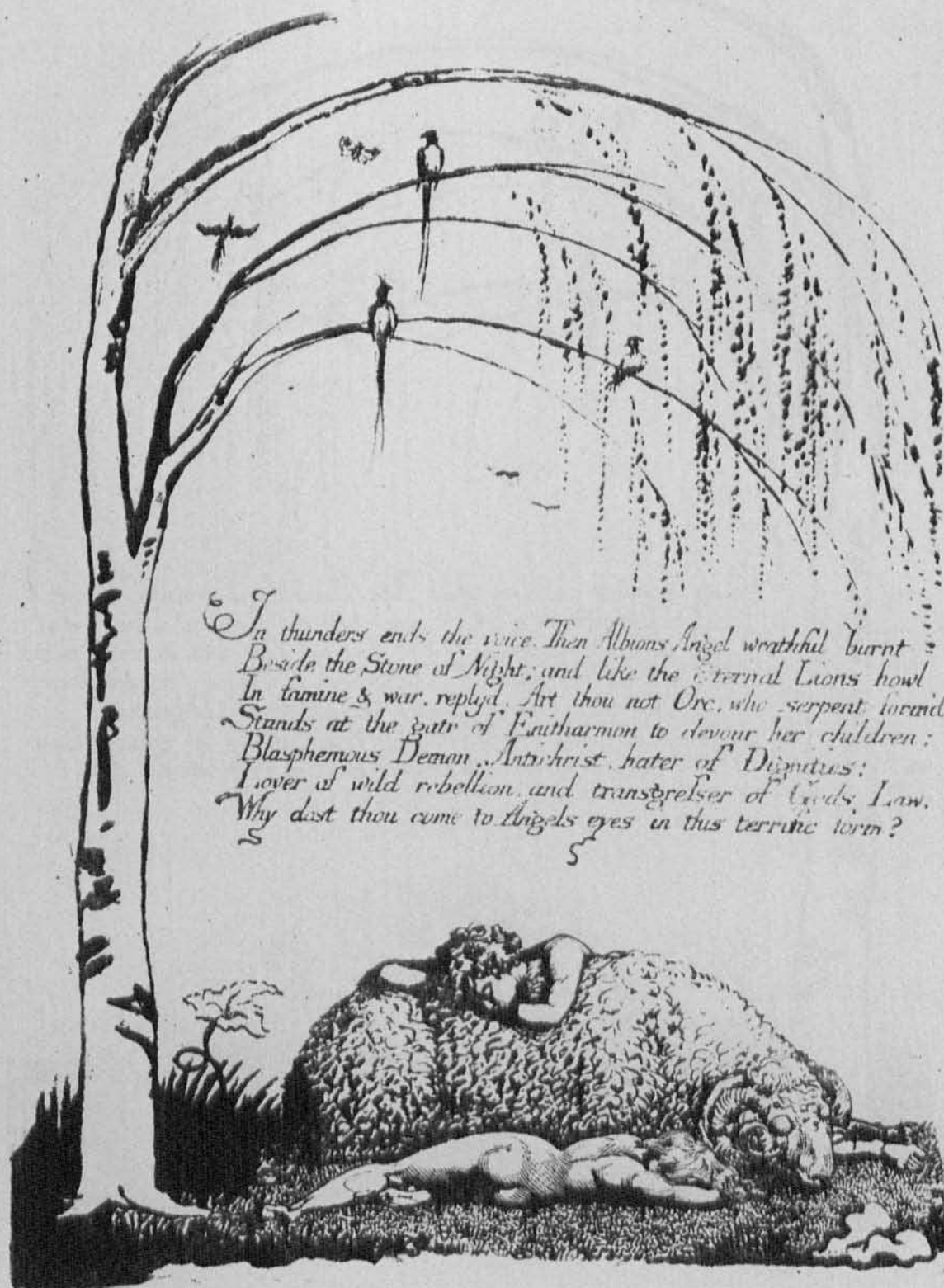
4. America (I) pl. 9 (Huntington Library). Two of the most curious features of this lovely design are the contrast between the bellicose words and the Edenic scene, and the apparently detached ankle and foot visible to the right of the ram's head.