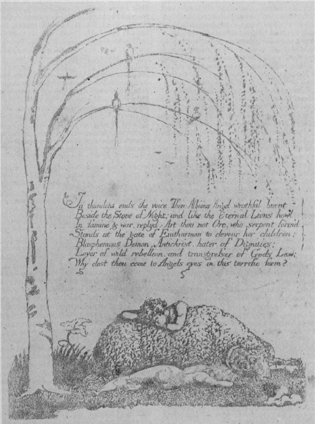
6. America pl. 9 from the "new" America .