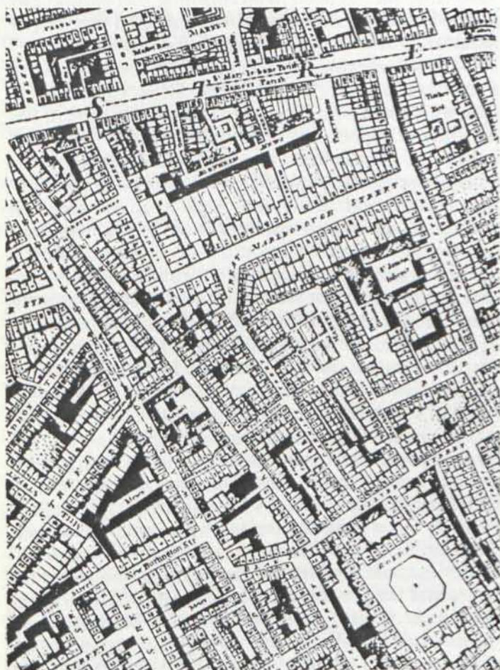
Section of Survey of London (1786) by J. Cary, showing area of Golden Square, King Street, Oxford Street and Poland Street (Oxford Street is the main road running east-west at the north of the map and Swallow Street is now Regent Street).

118; "On Another's Sorrow," 76)—or characterizes "deep" as "that most sinister of all words" (98). But in its relentless contextualization Gardner offers a salutary antidote to any who would seal Blake up in mere "textuality": "A year before Blake issued Songs of Experience a chapel was built 'on the green' in South Lambeth" (139). It cost £3000, "financed by the issue of sixty shares of £50 each, every shareholder being entitled to four seats," and Gardner even reproduces a 1793 watercolor of it, complete with cattle fenced off in the foreground pasture.