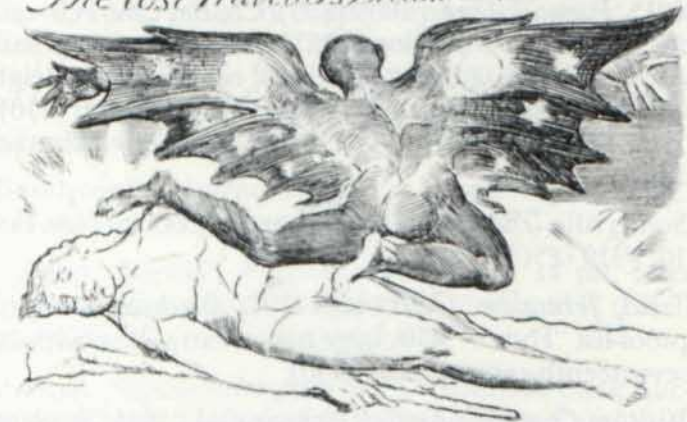
Epilogue, For the Sexes: The Gates of Paradise. PML 9948.35 copy J pl. 21.

To The Accuser who is The God of This World ~~~~~ Truly My Satan thou art but a Dunc And dost not know the Garment from the Man Every Harlot was a Virgin once Nor canst thou ever change Kide into Nair Thou art Worship'd by the Names Divine Of Jesus & Jehovah: thou art still The Son of Morn in weary Nights decline The lost Travellers Dream under the Hill