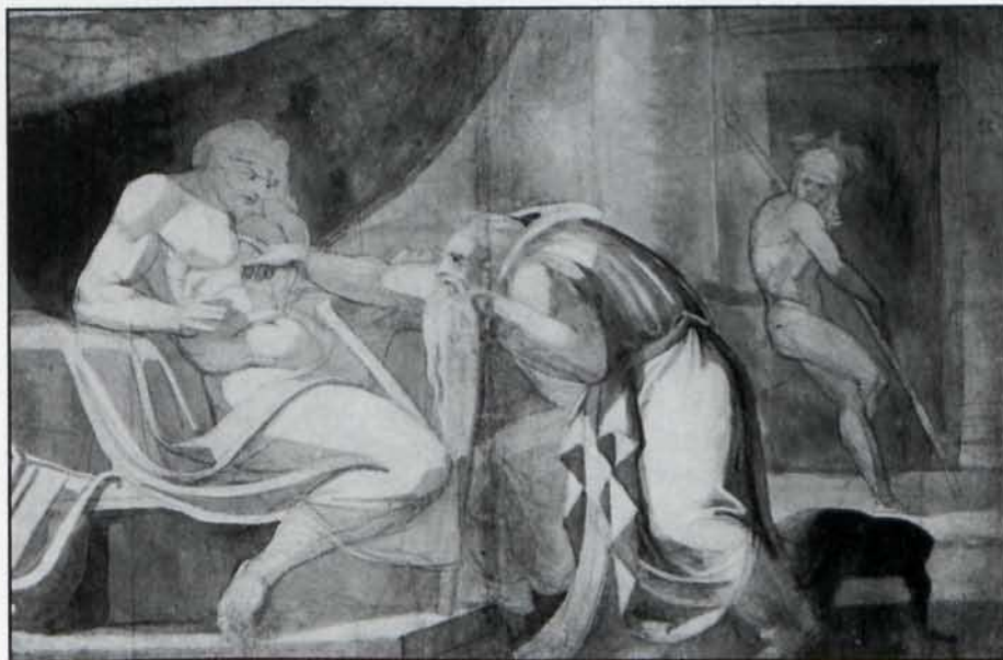
14. Henry Fuseli, King David Being Warned by the Prophet Nathan . Black chalk and gray wash, 61.6 x 91.8 cm., inscribed "Roma 7"—i.e., 1777?

tures from Italy , 1846. Pencil, approx. 13.5 x 8 cm. SL, 14 Nov., #38, illus., with 2 other drawings by Palmer, one pencil and the other gray wash over pencil, and 3 drawings by J. C. Hook, all from the collection of A. H. Palmer (surprisingly not sold on a modest enough estimate of £2000-3000).