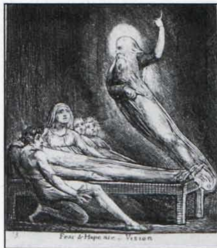
1. For the Sexes: The Gates of Paradise , pl. 15 (inscribed "13" in the pl.), final (fourth?) st. Intaglio etching/engraving, plate mark 8.1 x 7.2 cm., printed in black ink on wove sheet 21.9 x 14.3 cm. From a previously unrecorded group of 10 pls.

Another Blake collection, considerably smaller than Wolf's, was dispersed late in 1991. The group of books with Blake's commercial book engravings, basic secondary materials, and prints by Samuel Palmer was assembled by Oscar Lewenstein of Sussex. In October, the Tate Gallery acquired most of the books containing Blake's engravings. For those who might wish to make use of the Tate's holdings in the future, the following listing of volumes from the Lewenstein collection may be