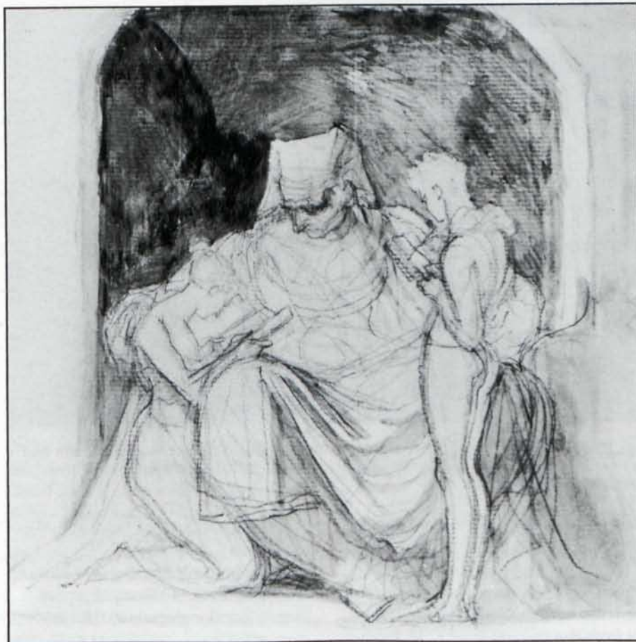
15. Henry Fuseli, The Spirit of Knowledge . Pencil and gray ink, 18.1 x 22.2 cm. Possibly an unpublished frontispiece design for William Roscoe's translation of Luigi Tansillo's The Nurse , 1798. Clearly a scene of instruction, like Blake's earlier designs, Age Teaching Youth (c. 1785-90, Butlin #91), the title page to Songs of Innocence (1789), and pl. 10 in The Marriage of Heaven and Hell (c. 1790). Like the adult in Fuseli's drawing, the posture of the figure on the right in the Marriage illumination shows a strong indebtedness to the sibyls and prophets in Michelangelo's Sistine frescoes.

A sketchbook of 67 leaves, 20.7 x 16.5 cm., containing drawings (pen and brown ink, some washes), drafts of letters, accounts, and diary excerpts, apparently dating from the early 1770s. CL, 9 July, #27, 6 pages illus. color (not sold on a brave estimate of £15,000-25,000).