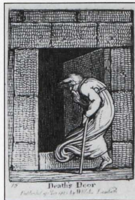
2. For the Sexes: The Gates of Paradise , pl. 17 (inscribed "15" in the pl.), final (fourth?) st. Intaglio etching/engraving, plate mark 7.2 x 5.2 cm., printed in black ink on wove sheet 11.3 x 8.1 cm. From the same set as illus. 1.

Poetical Sketches , copy E. Pickering and Chatto, Jan. cat. 686, #164, title page illus. ("Price on request.") Sold spring 1991 to an American private collector.