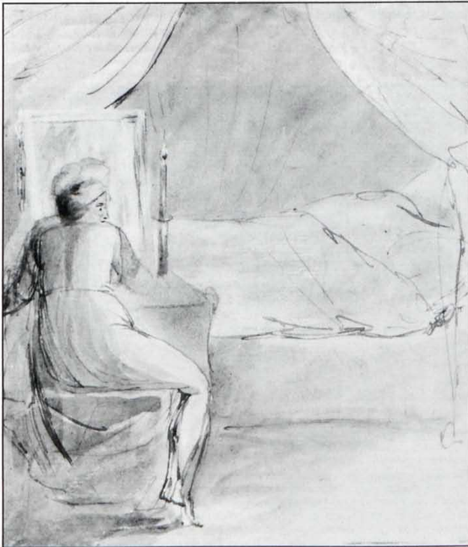
4. The Bed of Death . Pen and gray wash, 15 x 14 cm., c. 1780-82. Butlin #139, untraced since its sale at CL, 18 July 1957, #29 (£44). Christie's cat. of 9 July 1991 describes "rays of light" emanating from the bed, but I believe these are only lines indicating folds in the curtain behind the bed. The justification for the title, first used in the 1957 sale catalogue, is unclear, but the drawing may relate to several early works dealing with death and burial (see Butlin #135-37). Covering mirrors when someone has died is traditional, but the significance of this scene of a woman seated before a mirror, and the cause of her evident fear, should provide some entertainment for Blakean iconographers. Any suggestions will be welcome. Except for the illus. in the 1991 auction cat., I believe that this is the first published reproduction of the drawing.

John Windle, Oct. cat. 1, #35, 5th st., Sessler restrike, the full sheet as printed, stains from old mounting tape along margins, small repair center top margin, very small abrasion in the lower margin above "God" in the inscription, illus. ($8500)