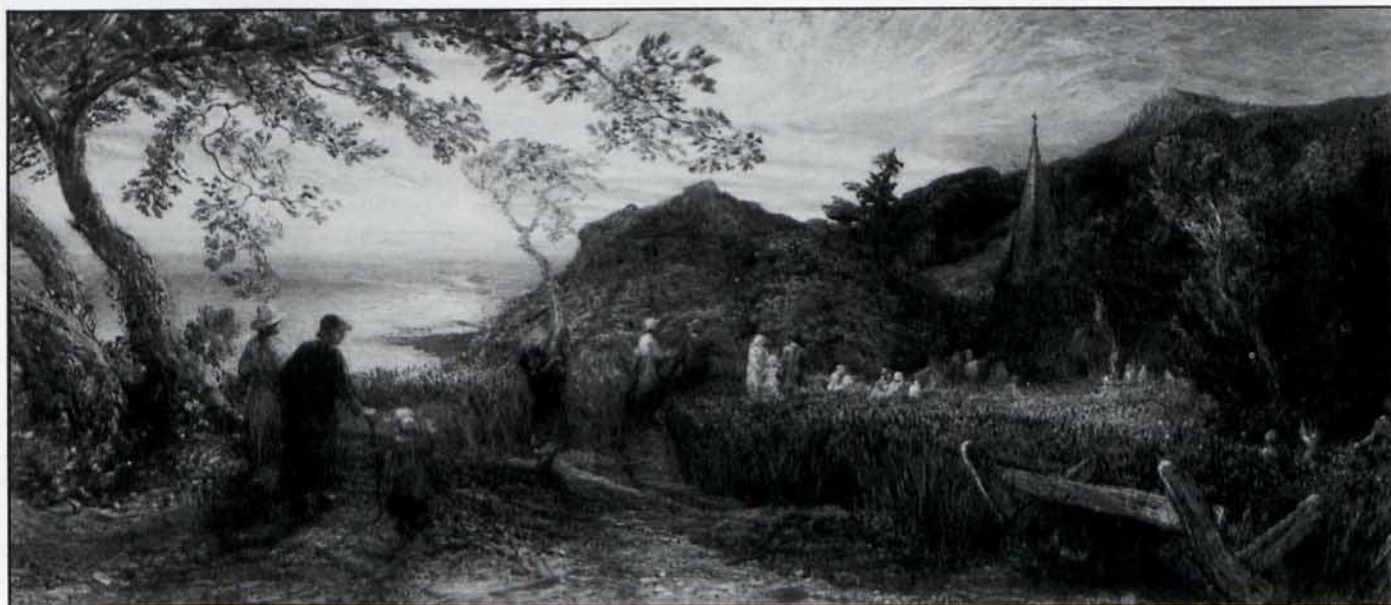
16. Samuel Palmer, Old England's Sunday Evening . Water color and body color with scratching out and gum arabic, 30 x 70 cm., signed and dated from 1874. This work strongly resembles Palmer's etchings of the same period, particularly in the rendering of the sky. Like the prints, this water color harkens back to the work of Palmer's Shoreham period, but it also marks the difference between recollection and immediacy, between the studied execution and elaborate building up of forms in Palmer's later work and the spontaneous line and exuberant coloring of his youth.

drypoint sketching of the title letters, slightly above and to the right of the engraved forms, as does the fourth-state impression in the Huntington Library. If the drypoint inscriptions distinguishing the fourth state had simply worn away, without purposeful work with a burnisher and/or scraper, these other delicate features would also have worn away or at least shown considerable wear. Thus I conclude that a fifth state was indeed created, although it is possible that someone other than Blake, such as Frederick Tatham, removed the drypoint inscriptions after Blake's death.