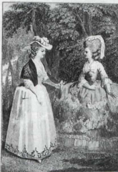
A Lady in the full Dress, & another in the most fashionable Undress now worn.