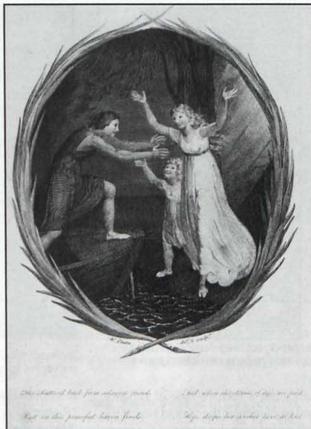
1. Frontispiece to Thomas Commin's An Elegy , 1786. Hand-tinted etching and engraving, 17.3 x 13.8 cm., British Museum, London.

Three typical pen and wash drawings of the 1780's, two on one sheet of paper, have turned up in the United States. Two seem to be related to Thomas Commin's An Elegy , while the other appears to be an independent composition. 1