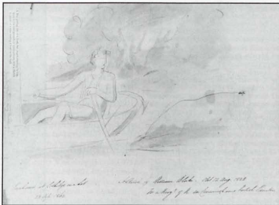
3. Sketch for Commins's Elegy , c. 1786 (verso of illus. 2). Pen and wash over pencil on paper, cut irregularly, approx 26.5 x 34.0 cm. Private collection, U.S.A.

It is noticeable that in the song text the "shatter'd Bark" finds rest in a peaceful "Heaven" whereas in the lines below the frontispiece rest is found in a peaceful "Haven"; this last is closer to what Blake illustrates in his engraving.