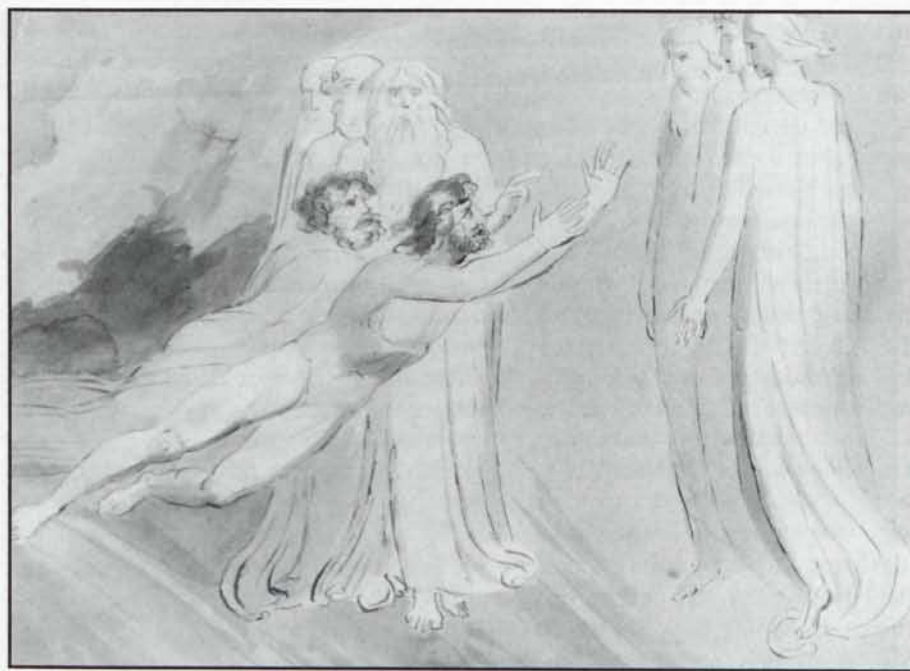
4. "An Encounter in Heaven," c. 1780-85. Pen and wash over pencil on paper, approx 30.5 x 40.5 cm. Private collection, U.S.A.

The works from the Cunliffe collection in the 1895 sale comprise, as well as four lots by other artists, 10 lots containing works attributed to Blake, numbers 96 to 105 (plus an india proof impression of the portrait by Linnell of Blake), but none of the more important illuminated books that passed to Henry Cunliffe's nephew Walter, grandfather of the present Lord Cunliffe. With the reappearance of these two sheets of drawings it seems that one can now identify all the drawings in the 1895 sale and, in turn, those purchased by Henry Cunliffe in 1862.