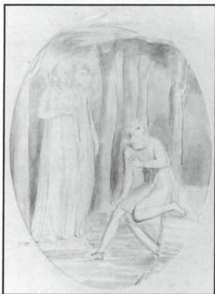
2. Alternative design for Commins's Elegy c. 1786. Pen and wash over pencil on paper, cut irregularly, approx 34.0 x 26.5cm. Private collection, U.S.A.

hand, but a relative lack of subtlety, and in particular the way in which the color runs over the edges of the forms in the framing oval, suggests the work of an amateur, not Blake himself.)