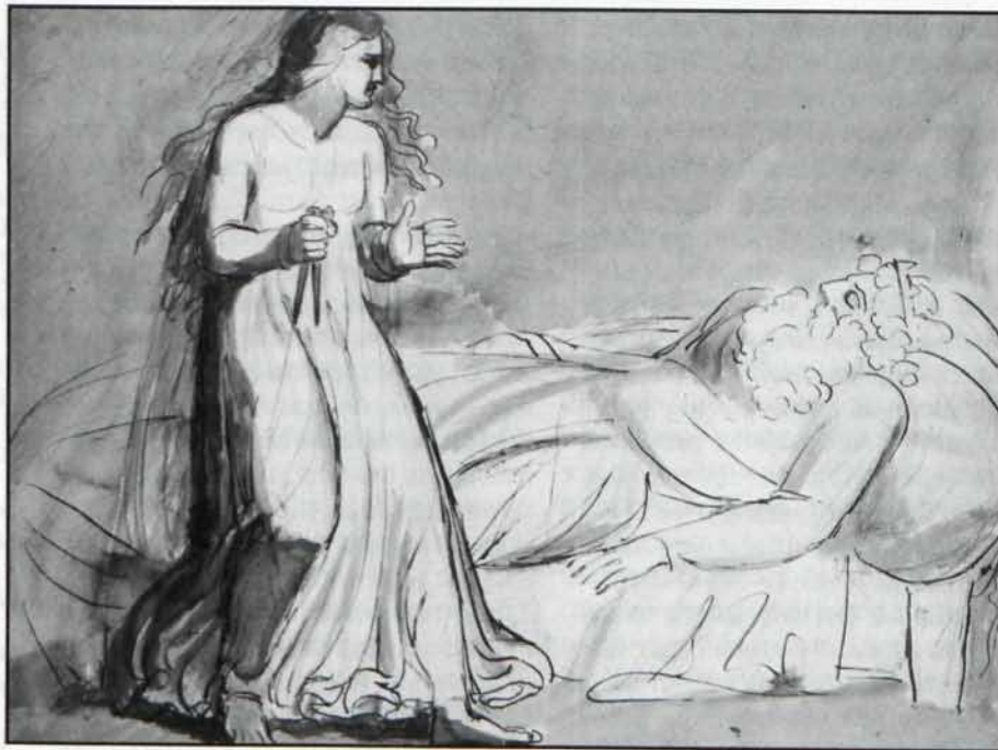
5. "Lady Macbeth and the Sleeping Duncan," c.1785. Pen and grey and brown washes over pencil, on paper, trimmed, 32.7 x 42.6 cm. Thos. Agnew & Sons, Ltd, London.

This is in fulfillment of Macbeth's suggestion, in act I, scene vii, that he should use the daggers belonging to Duncan's two chamberlains, made drunk by Lady Macbeth, so that it would look as if they had committed