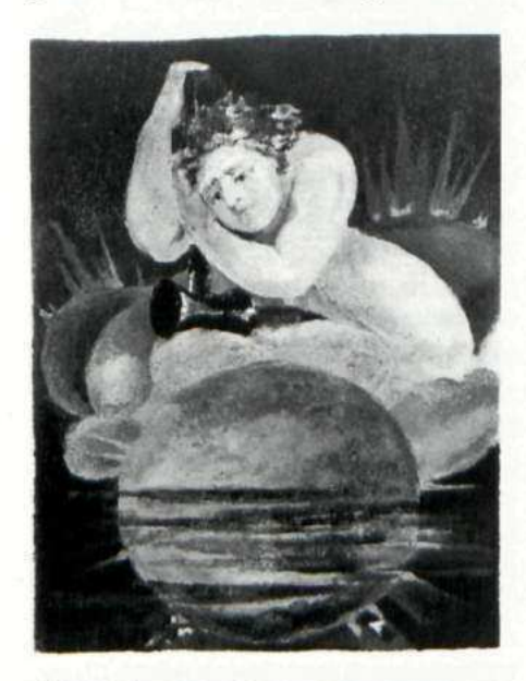
Blake, The Song of Los , plate 8, copy E. Color printed in 1795 from a copperplate, probably unincised, 23.5 x 17.5 cm. Huntington Library. To be included in the Huntington's exhibition, "Blake's Illuminated Prints," fall and winter 1994.