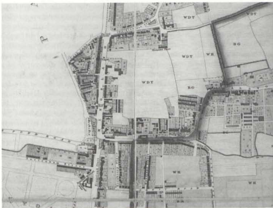
7 Map of Dalston, showing Bath Place, detail from a map of Hackney, 1831.