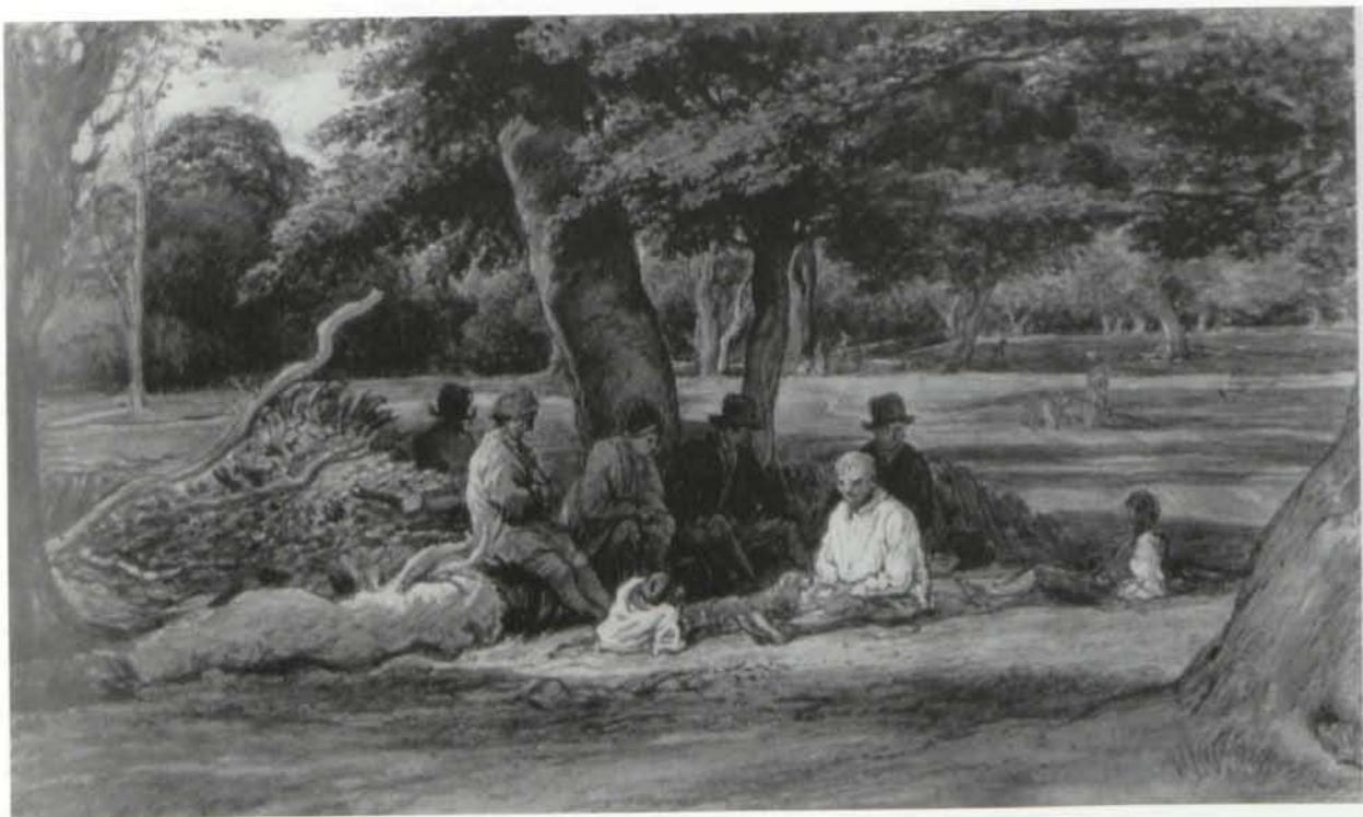
7 John Linnell. Resting Woodcutters, Bray Wood, Windsor . Pen and brown ink and water colors over pencil, heightened with body color. 16.5 x 27 cm., signed and dated 1827. Linnell's 1818 etching, "Woodcutters' Repast," is a very similar design, reversed.

fore title inscriptions on laid India, later morocco ($450).