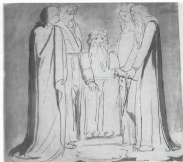
4 The Elders of Israel Receiving the Ten Commandments . Pencil, pen and black ink, gray wash, 31.1 x 33 cm. Datable on stylistic grounds to c. 1780-85. Butlin #11. A rough pencil sketch on the verso, showing a seated woman with upraised arms, may date from a slightly later period.

Young, Catalogue of Pictures...in the Possession of Sir John Fleming Leicester , 1821. Sims Reed, Nov. cat., #2146 (£165). Marlborough Rare Books, Dec. cat. 177, #162, uncut in original boards (£150).