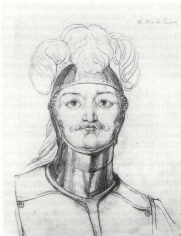
3 The Black Prince , leaf 56 verso in the larger Blake-Varley sketchbook of 1819. Pencil, sheet 25.5 x 20 cm. Inscribed in pencil by Varley, "the Black Prince." Edward, Prince of Wales (1330-76), was given his sobriquet after he wore black armor at the battle of Crécy in 1346.

G. Cumberland, An Essay on the Utility of Collecting the Best Works of the Ancient Engravers of All the Italian Schools; Accompanied by a Critical Catalogue , 1827. Oak Knoll Books, March cat. 198, #729, half calf worn ($300). Ken Spelman, May cat. 38, #46, scattered foxing, original boards rebaked, original backstrip and label preserved (£220). Quaritch, Oct. cat. 1254, #30, "publisher's" (?) cloth rebaked (£250). Cumberland lent Blake the manuscript of his "Catalogue" in Nov. 1823 (BR 279).