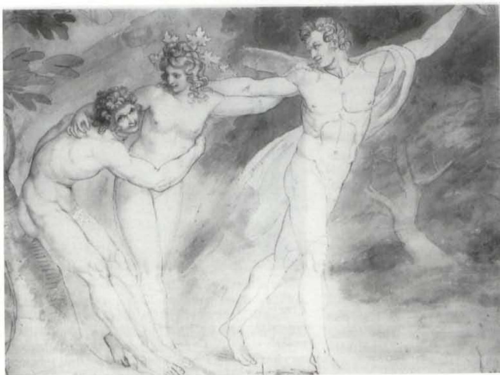
5 John Flaxman. Three Classical Figures in a Landscape . Pen and gray ink, gray wash, 47.5 x 64 cm. Datable on stylistic grounds to the first half of the 1780s when Blake produced a good many similar drawings, although usually not as finished in facial details and expression as this large composition.

Piping Down the Valley Wild . Oil, 55.9 x 68.5 cm., signed and dated 1872. CSK, 12 March, #176, illus. color (£3220). I do not know the source of the title; but at least it, and perhaps the painting, was inspired by a line from the "Introduction" to Songs of Innocence . The image bears no relationship to any design by Blake known to me.