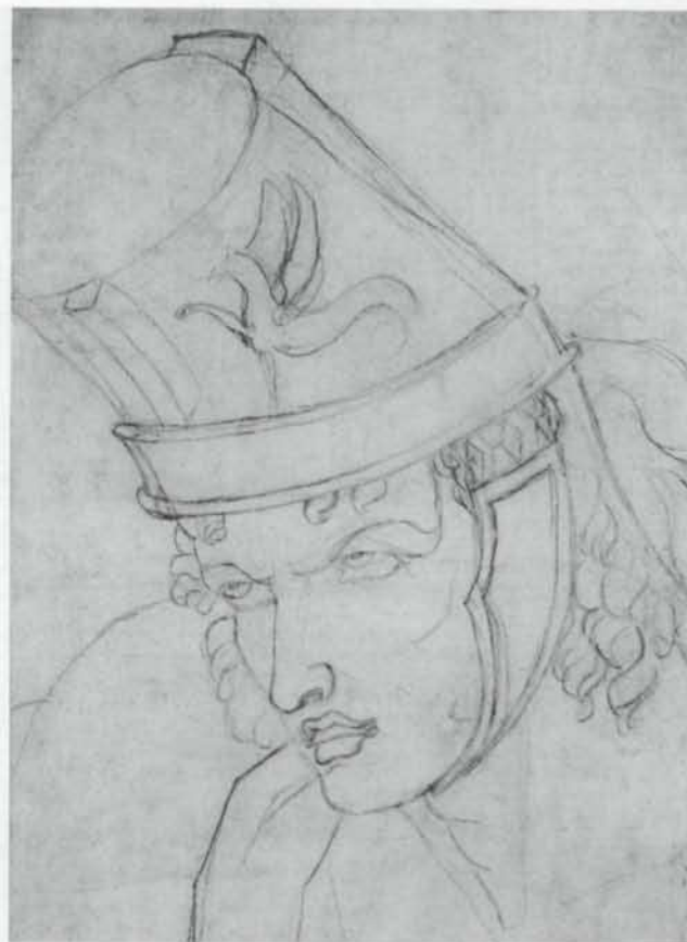
3. Visionary Head: A Man Wearing a Tall Hat (provisional title). Pencil strengthened in part with black chalk, 36 x 27.7 cm. Datable to c. 1819-25. Not in Butlin. First published and attributed to Blake in Agnew's 130 th Annual Exhibition of Watercolours & Drawings, 5-28 March, #18, illus. color. The sheet of paper appears to have been trimmed, given the way the image is cut into on the right and left. But even at its present dimensions, this may be the largest single Visionary Head, comparable in size to the double portrait of Pindar and Lais the Courtesan on a sheet 26.7 x 41.9 cm. (Butlin #711). The presence of black chalk is unusual, but there are a few other Visionary Heads in which Blake (or possibly John Linnell or John Varley) used it to strengthen pencil lines (e.g., the head of an Archbishop on leaf 30 verso, and the head of Charlemagne on leaf 45 verso, of the Larger Blake-Varley Sketchbook). I have not been able to find any clear precedents, classical or medieval, for the extraordinary headgear. The cheek guard looks Roman.

Job engravings. Larkhall Fine Art, complete set, 1874 printing on laid India, light foxing, some pls. damp stained in upper margin, loose, illus. (£17,500). BH, 31 March, #23, pl. numbered 11 only, apparently the 1826 printing on wove paper, some staining, illus. (£480). R. E. Lewis & Daughter, May cat. of "recent acquisitions," #13, pl. numbered 13 only, "Proof"