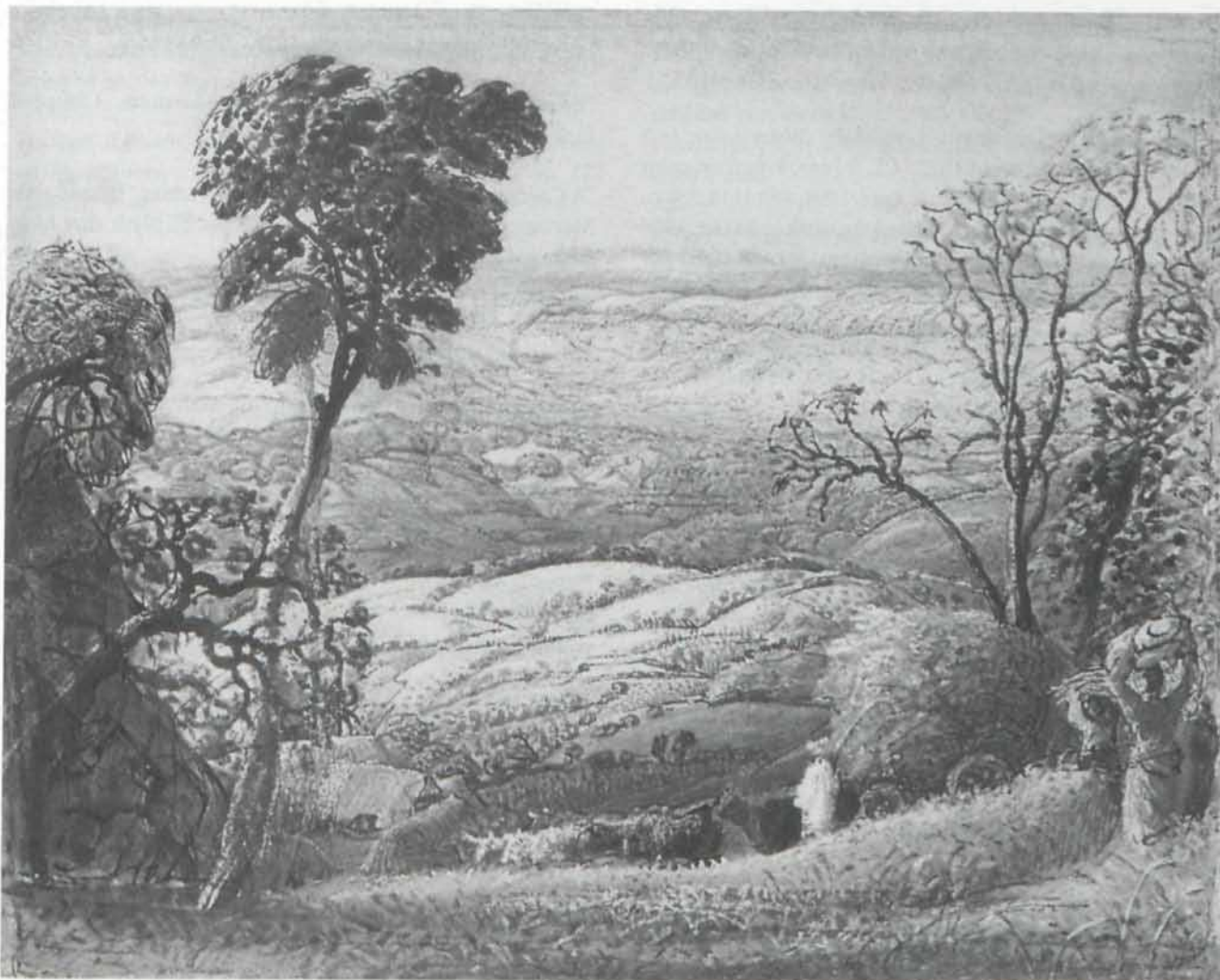
5. Samuel Palmer, The Golden Valley . Water color with body color, pen and black ink, gold, and scratching out, 13 x 16.2 cm., datable to c. 1833-34. Collection of Leon Black, New York. Arguably the finest Shoreham-period water color still in private hands, The Golden Valley can be grouped with 2 other fine works of about the same date, The Weald of Kent and The Timber Waggon , both in the Yale Center for British Art, New Haven, Connecticut.

Landscape with Windmill . Water color, 12 x 16.5 cm., datable to c. 1851. Lowell Libson, London, Nov.-Dec. exhibition of water colors and drawings (price on request). Previously sold CL, 21 Nov. 2002, #31, under the title A Windmill near Pulborough, West Sussex , illus. color (£6572).