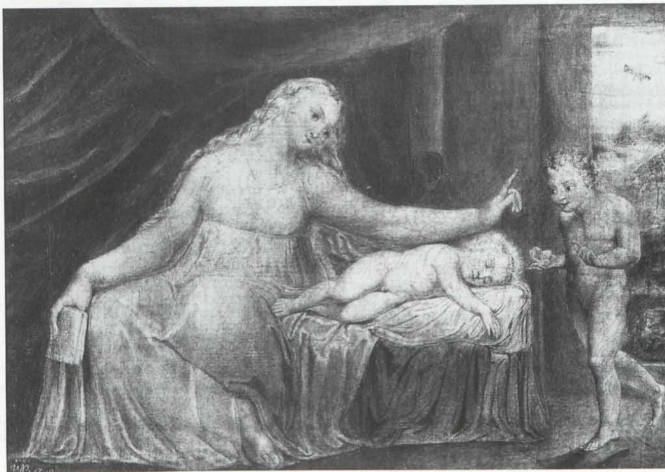
2. The Virgin Hushing the Young Baptist, Who Approaches the Sleeping Infant Jesus . Tempera, 27 x 38.2 cm., inscribed "WB inv [in monogram] 1799." Butlin #406. Reproduced by permission of John Windle.

The Judgement of Solomon , a copy (with variations) of the Vatican fresco of the same subject designed by Raphael. Pen and black ink, water color with body color, 13.5 x 17.5 cm. Attributed to Blake; not in Butlin. SL, 27 Nov., #235, sold "The Property of a Lady" who acquired the work "circa 1960," illus. color (£15,600). Previously sold SL, 28 Nov. 2002, #235, illus. color (£26,290). If actually sold in 2002, rather than bought-in, the water color was apparently returned to the vendor. For discussion and illus., see Blake 36.4 (spring 2003): 116-19.