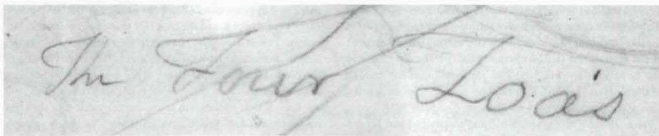
2. The Four Zoas , page 1 (title page), detail. Add. 39764.

course, and often what they tell is different from the original tale. In the manuscript itself, the mark is almost certainly in pencil, as the color and the slight granulation (characteristic more of pencil than of ink writing) suggest. It is quite clearly darker than the pencil writing below it, but its placement makes it very hard when scanning the line—or even simply looking at the page—to deny the strong possibility, if not the likelihood, that it is an intentional apostrophe.