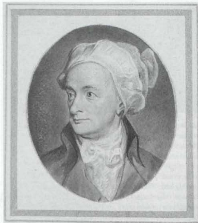
1. (above) William Cowper, by William Blake (1801).