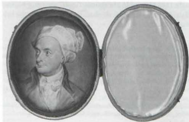
2. (below) William Cowper , by William Blake (1801). Reproduced by permission of the trustees of the Cowper and Newton Museum, Olney, Buckinghamshire, England.