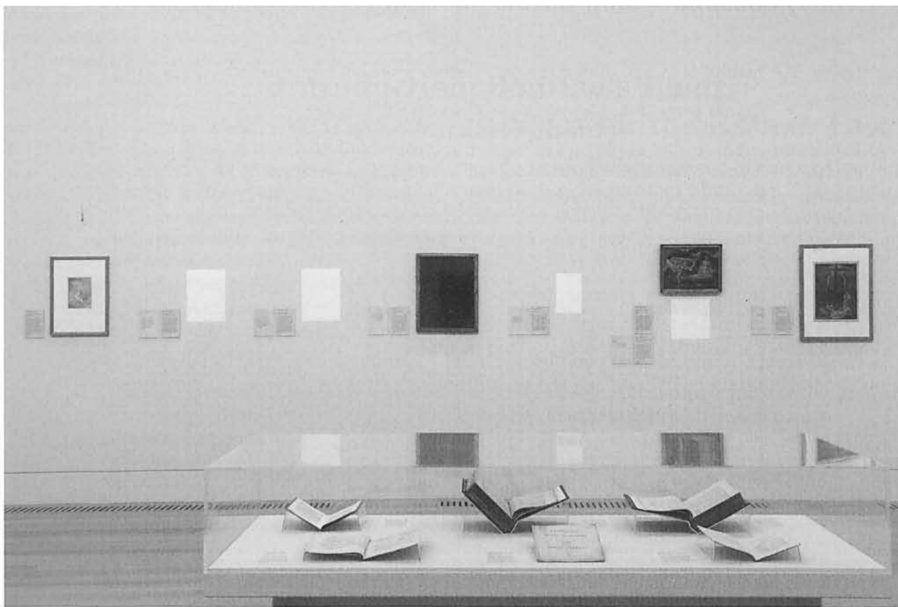
Satan Calling Up His Legions in the middle, with spaces to the left for The Goats and The Spiritual Preceptor and to the right for The Bramins and the watercolor Cain Fleeing (the tempera is above). The case contains catalogues from other 1809 exhibitions.

Form of Pitt , The Bard , and Satan Calling Up His Legions are so browned and/or otherwise damaged that it is hard to see what is going on in them (though in the case of Satan Calling and at least one lost picture the obscurity may have been a deliberate effect). Sir Jeffery Chaucer and the Nine and Twenty Pilgrims on Their Journey to Canterbury is the most presentable of the original temperas, though it too is in sadly deteriorated condition, so Blake's plan of demonstrating the superiority of the "Ancient Method of Fresco Painting Restored" (E 529) with a group of exemplary and durable pictures is definitely not realized in room 8. The curators have gestured toward the cultural context in 1809 by displaying some other 1809 catalogues and dedicating one wall to a selection of exhibition pictures in oil and watercolor by other artists, but most of them seem to have been chosen because they were available at the Tate, not because they are especially relevant to Blake's show. With the exception of Thomas Stothard's Chaucer painting, the importance of which is discussed below, the pictures that are provided for context merely indicate that Blake's works were far out of the mainstream without giving any clues to why they might have been that way, and the contemporary exhibition catalogues displayed under glass do not reveal very much either.