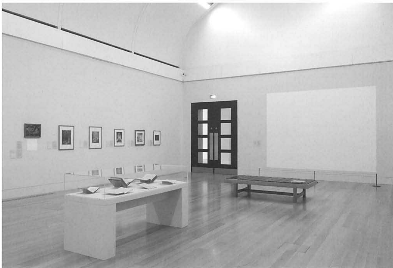
The space for The Ancient Britons.

tures he exhibited in 1809 prominently thematize light or its absence, as well as explicitly contrasting spiritual and natural vision (at that time a very sore point for Blake, lately stung by the reviews of his Grave illustrations). And though it probably was not quite so impossibly murky in Blake's day, Satan Calling was always expected to challenge the viewer to appreciate Blake's visions, even when severely deprived of Newtonian light. Darkness was also important in another "experiment Picture" in the 1809 show, The Goats , now lost. Blake explained in his catalogue that it was inspired by an episode in Wilson's A Missionary Voyage to the Southern Pacific Ocean (1799) in which native women dressed in leaves were stripped naked by hungry shipboard goats. The representation "varied from the literal fact, for the sake of picturesque scenery," Blake wrote, and though it was "laboured to a superabundant blackness," he called it to the special attention of the "Artist and Connoisseur" (E 546). The Tate's gallery label suggests that "Blake may have intended the picture as a joke at the expense of the straight-laced [ sic ] missionaries," but while it probably was a joke it probably wasn't aimed at the missionaries, if only because Blake never mentioned them or their laces. 1 My