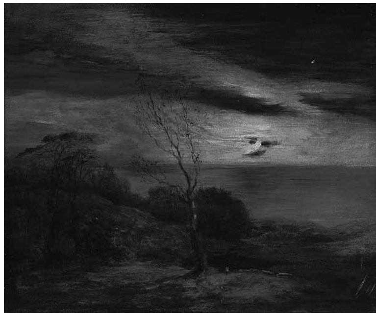
9. George Richmond. Dawn . Oil on panel, 35.0 x 40.7 cm., inscribed on the back "The moon is up. I have not / heard the clock. and she / goes down at twelve. / G. Richmond." The absence of human figures and the loose, painterly, and atmospheric style are unusual for Richmond; the work would probably not be attributable to him without the verso inscription. Possibly datable to the late 1820s or early 1830s when Richmond, Palmer, and others among Blake's youthful followers were interested in moonlit scenes. "Their motto was 'Poetry and Sentiment', and at night they rambled over the nearby countryside by moonlight or in thunderstorms, or sat on campstools in the open air, reciting poetry to one another, and sometimes acting scenes from Macbeth " (Raymond Lister, George Richmond: A Critical Biography [London: Robin Garton, 1982] 15). The inscription on the painting, quoted here from the CSK cat. of 16 March, is from the beginning of act 2, scene 1, of Macbeth , with "the moon is down" changed to "the moon is up." The 1 st 10 words are spoken by Fleance, the remainder by Banquo. Richmond's engraving of 1827, "The Fatal Bellman," includes an inscription from Macbeth , act 2, scene 2: "It was the owl that shriek'd, the fatal bell-man." Lister mentions "a drawing" by Richmond "of Lady Macbeth of about 1825" (124). Dawn previously sold SL, 31 March 1976, #96.

Letters by Richmond. See Palmer, six letters, above.