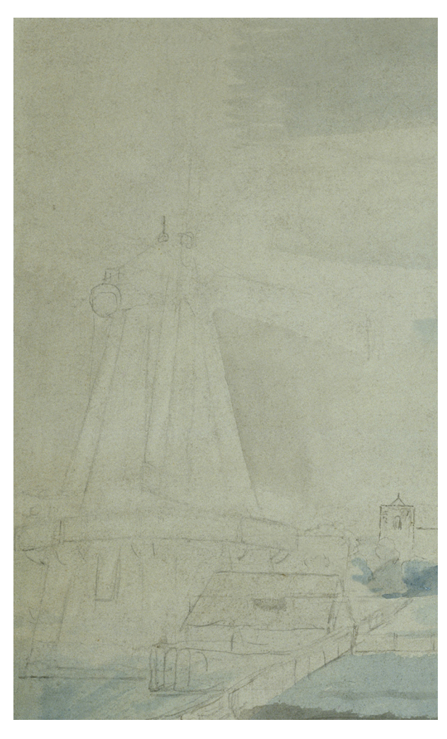
3. (left) Detail from a copy of a mid-nineteenth-century photograph of White Mill. West Sussex Records Office, General Photographic Collection. Catalogue no. PH 21344. (right) Detail from Landscape near Felpham . © Tate, London 2013.