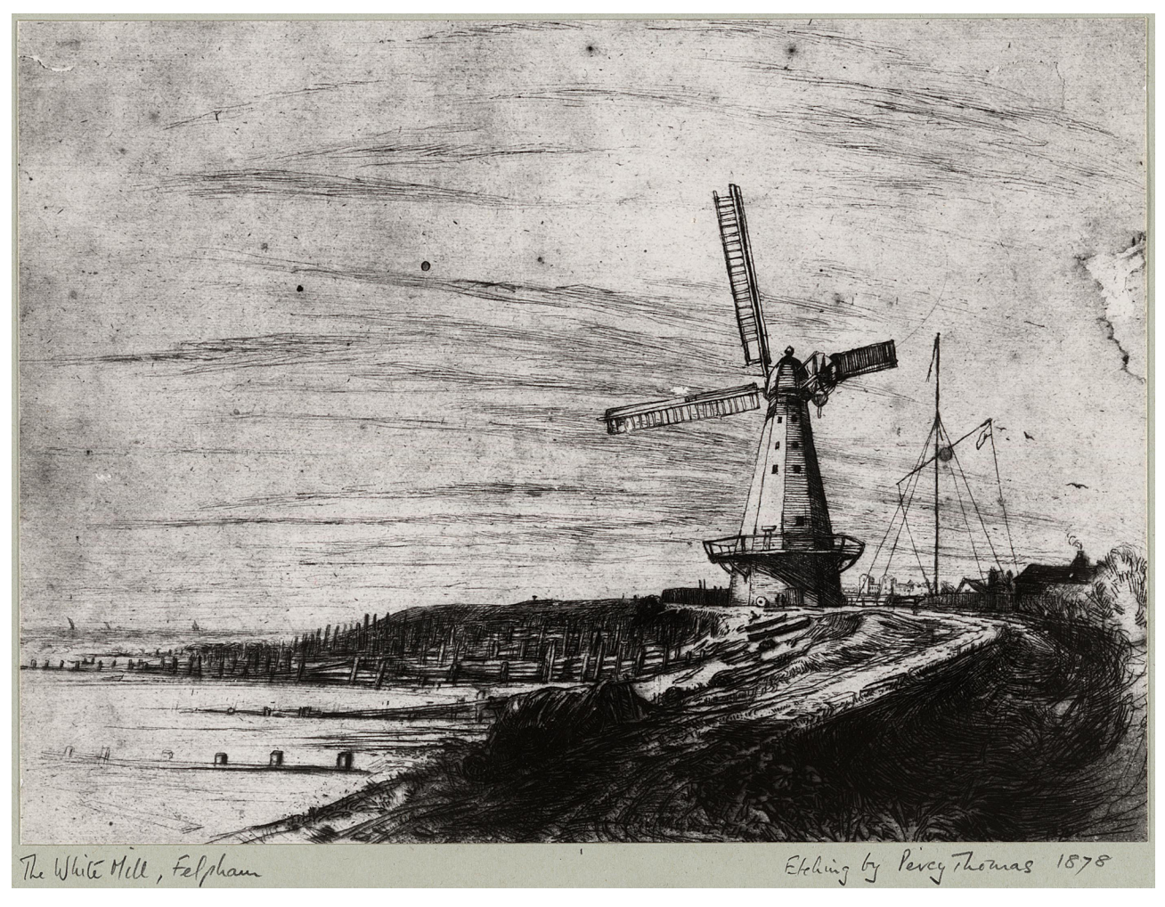
2. White Mill, Felpham. Copy of an etching by Percy Thomas, 1878. West Sussex Records Office, General Photographic Collection. Catalogue no. PH 21347.

of the building from the nineteenth century. The erosion of the shore can be seen in illus. 2 (Percy Thomas's 1878 etching), and the sheer size of the mill can be seen by looking at the human figures in illus. 3.