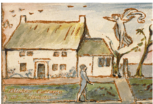
4. (left) Blake's cottage (early twentieth-century postcard). (right) William Blake, Milton copy D (1818), pl. 36, detail.