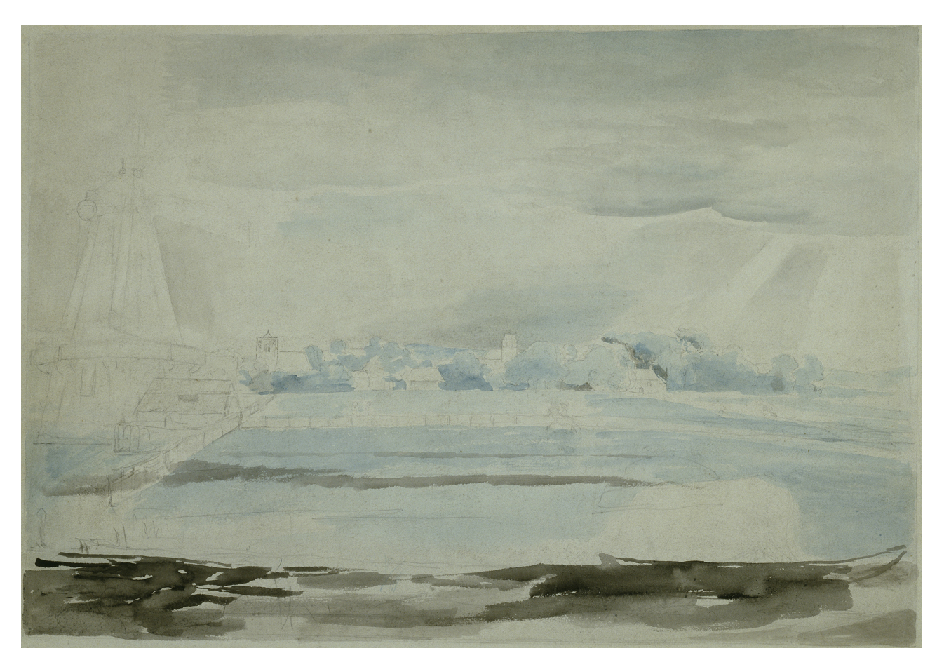
1. William Blake, Landscape near Felpham, c. 1800.