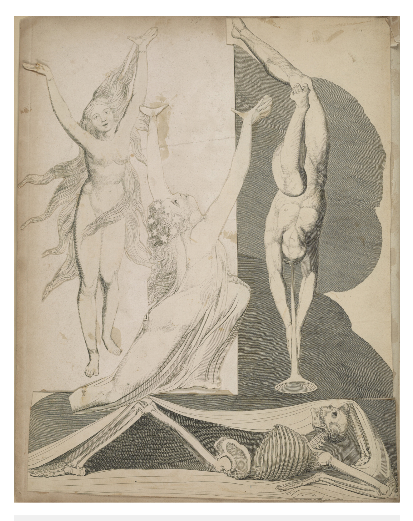
2. Blair's Grave (1813) extra-illustrated with prints from Young's Night Thoughts (1797) p. 19 (trumpeter plunging to skeleton), p. 46 (nude woman gesturing), and p. 43 (woman with stars in her hair). The page carefully echoes the engraved title page of Blair's Grave (1808), which faces it (illus. 3). Library of Congress, Rosenwald Collection.