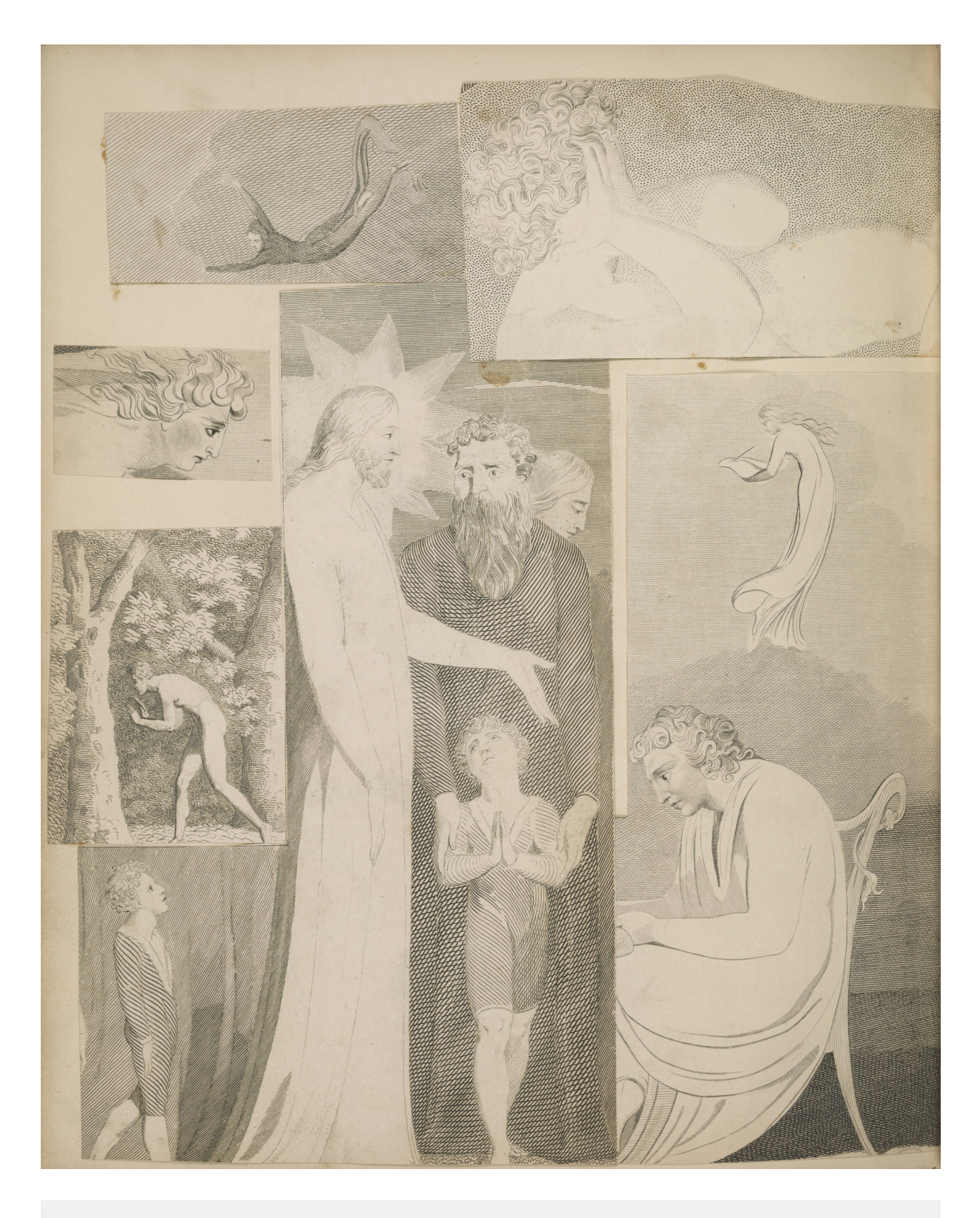
4. The Night Thoughts cuttings are from p. 87 (in center, Christ with children), p. 31 (at right, man in chair beneath floating woman), p. 4 (on left, man in woods), p. 49 (above him, head of curly-haired man), p. 15 (above him, floating figure reoriented from almost vertical to horizontal), and p. 75 (at top right, figure reoriented). It is difficult to find a common theme in these images. Library of Congress, Rosenwald Collection.