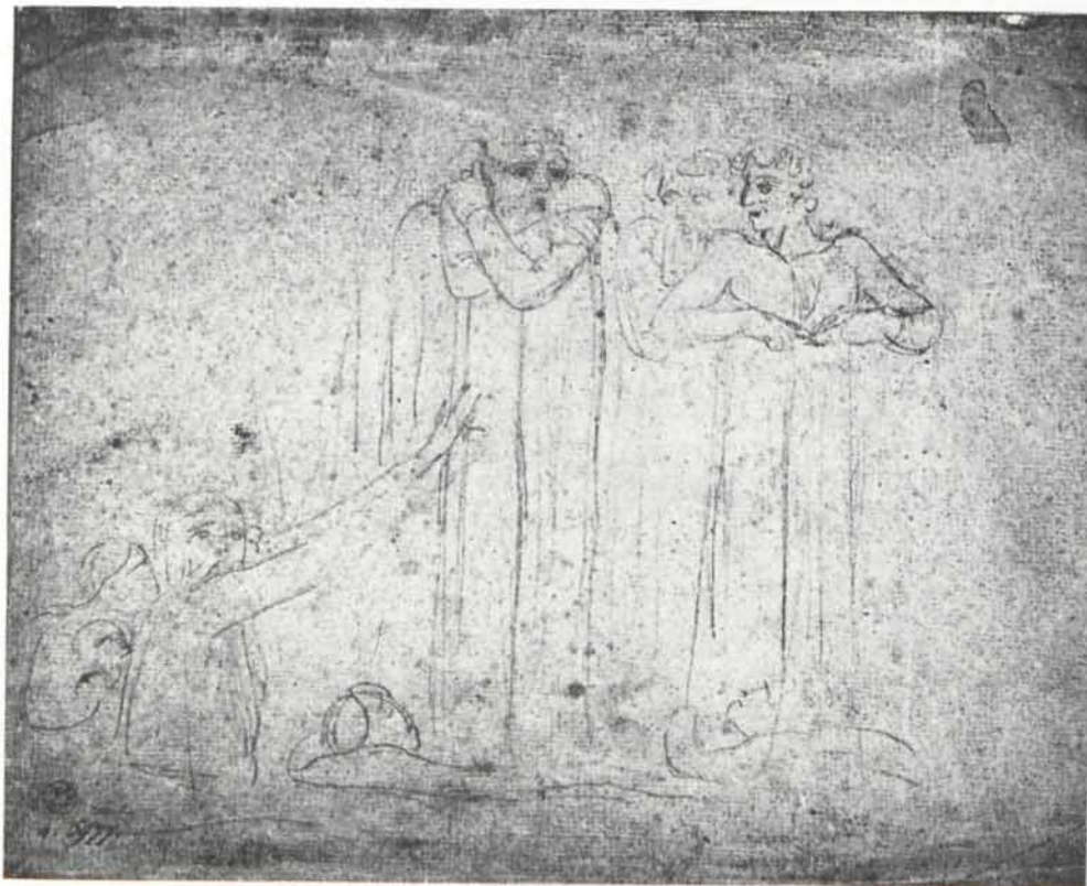
1 An early drawing. Uffizi Gallery, Florence.