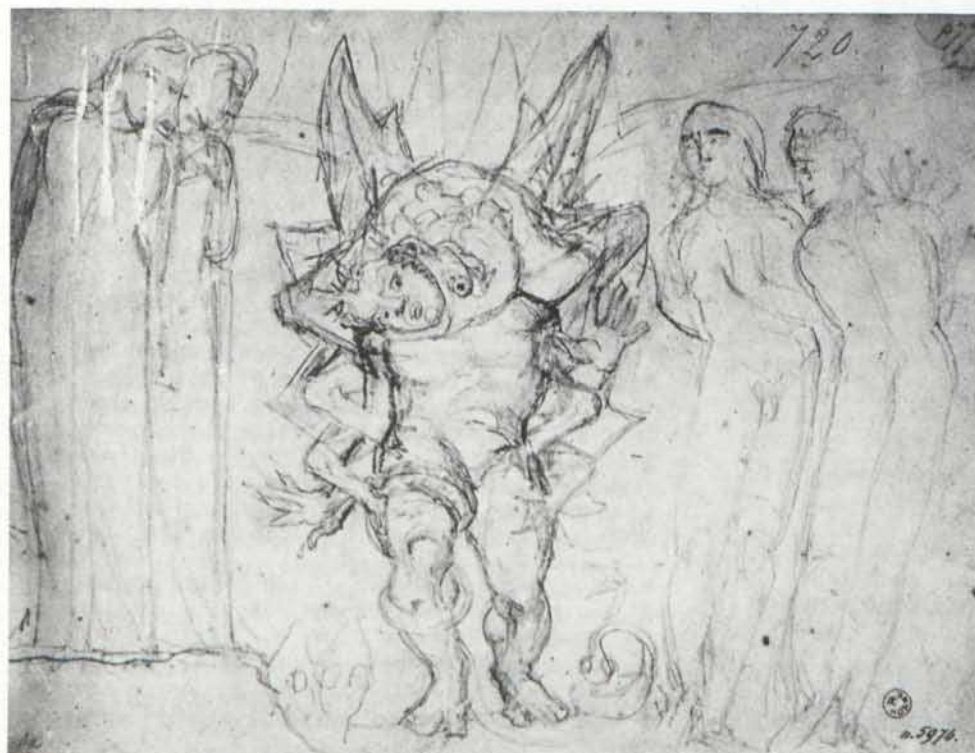
2 Sketch for "The Six-Footed Serpent attacking Agnolo Brunelleschi," Dante illustration no. 51. Uffizi Gallery, Florence.