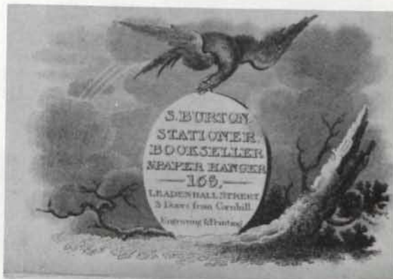
14 Trade card, S. Burton Stationer. The Metropolitan Museum of Art, Bella C. Landauer Collection, 1921.

Since Blake wrote a good deal about his own capacities for drawing and the quality of his "execution," and since we also know he could draw in any way he chose--realistically or symbolically--his choice of floral motifs and the sources he chose to emulate are of some importance to an understanding of his purpose. It is possible that he chose the iconographically familiar forms of popular textile designs because in this way he reaffirms a language of Art which he firmly believed was available to everyone ("... no one can ever Design till he has learned the Language of Art by making many Finished Copies both of Nature and Art and of what ever comes in his way from Earliest Childhood" [ Annot. to Reynolds ]). The universality of such forms, which transcend linguistic differences, implies a unity in the human imagination which makes all art and all religions one. The full significance of Blake's visual symbols continues to be explored by Blake scholars; I have here called attention to a more mundane aspect of Blake's technique as a designer, yet it may indicate the attention and importance attached to "Minute Particulars" as the foundation of divine Vision. As Blake wrote in the Annotations to Reynolds , "Minute Discrimination Is Not Accidental All sublimity is founded on Minute Discrimination."