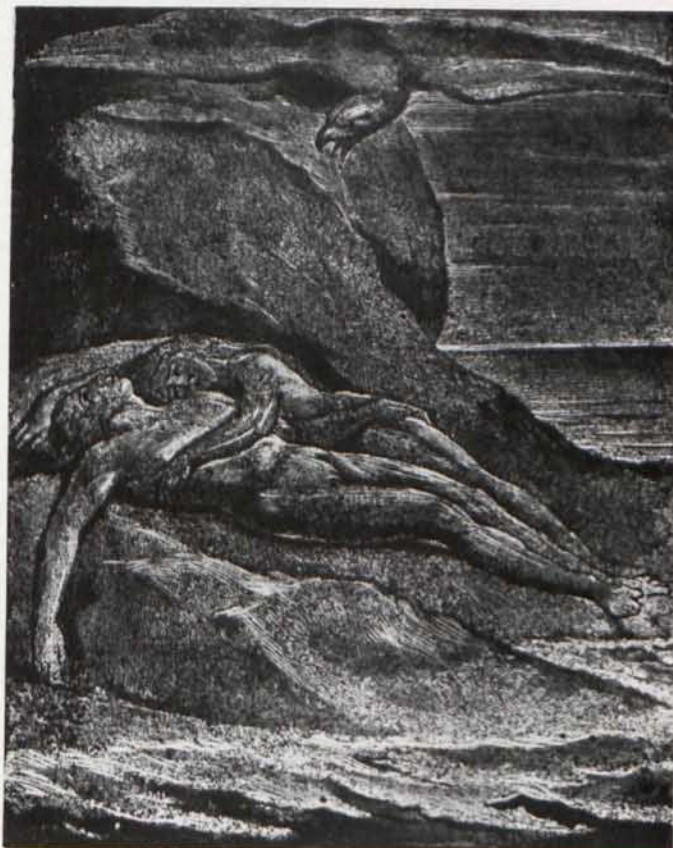
15 Plate 38 of Milton .