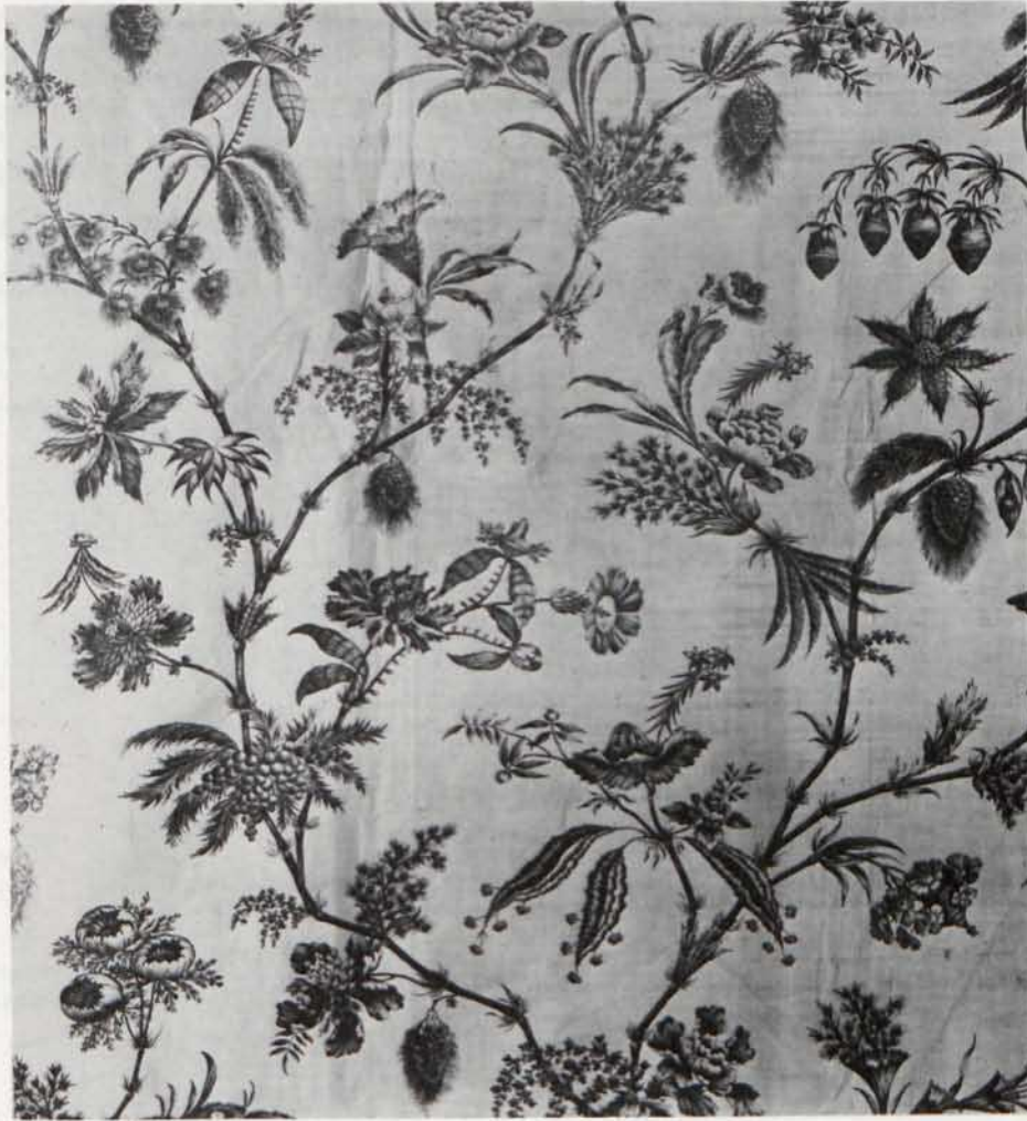
2 Cotton, plate-printed in blue, ca. 1775. Victoria and Albert Museum.