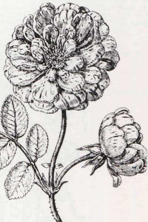
VARIOUSLY-COLOURED ROSE. C. v. d. P. (Rosaceae.)