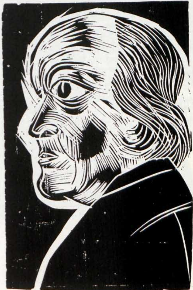
Blake portrait for Proverbs of Hell , Taurus Press